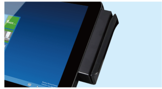
Magnetic Stripe Card Readers