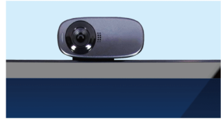
Camera Easy Installation