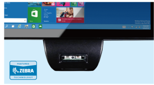
Price Checker (Zebra Engine Inside)