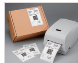
> Cutter mode

The OS-314plus desktop barcode printer offers advanced functions and features in an attractive, space-saving design. A 300dpi thermal transfer printer, the OS-314plus provides up to 4ips print speed and multiple interfaces for meeting low-to-mid volume printing demands, and also supports PPLA/PPLB emulations. New features include a more secure, yet easy-to-open cover lock and saw tooth and blade tear-off bars for both thick and thin paper. This printer is perfect for applications such as 2D barcode labels, apparel labels, and jewelry labels printing. and its top cover also detached to support use in kiosks and other special applications. Standalone applications require only an optional scanner. Other printer options include a cutter, an RTC, and an 8-inch OD stacker, and a 4M Asian Font Card. The new OS-314plus delivers enhanced features, excellent performance, and out-standing value.