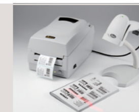
> Standalone mode with scanner