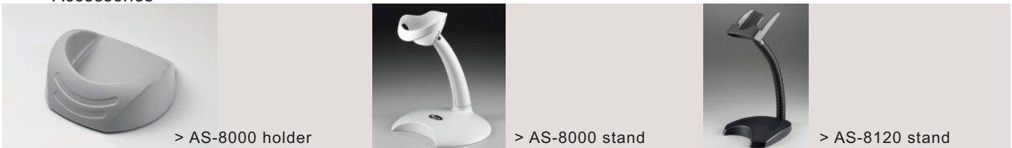
> AS-8000 holder